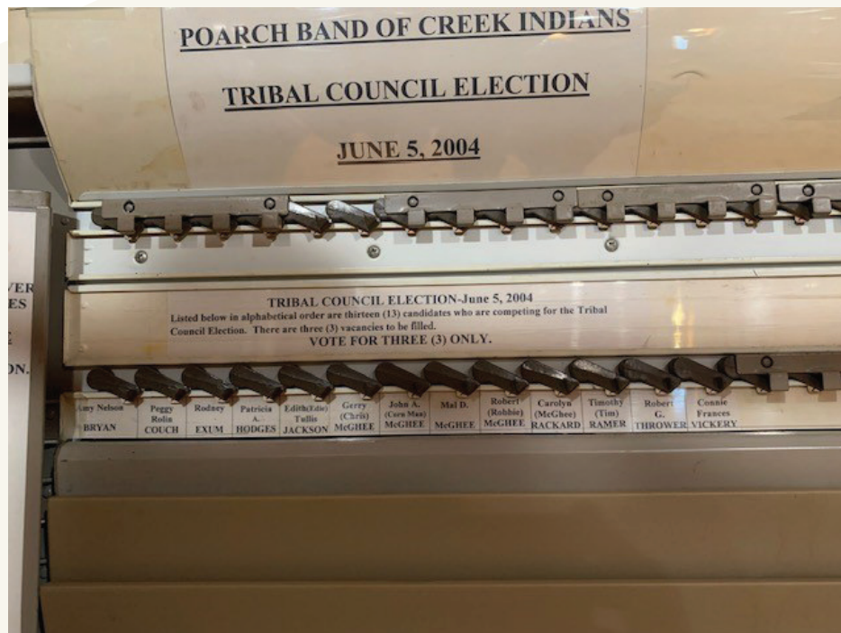
2004 Tribal Election Voting Machine.