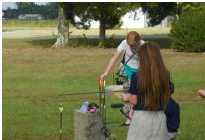
Archery time at the Boys & Girls Club!