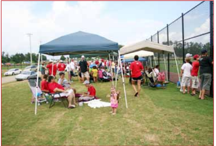
Family and friends all show up to support their favorite teams!

The Poarch girls from the 13-15 year old bracket also placed in this year's tournament. After defeating Seneca in round one the girls team went on to go one for three in play with GWY coming