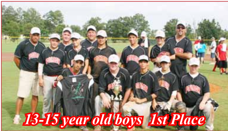
13-15 year old boys 1st Place