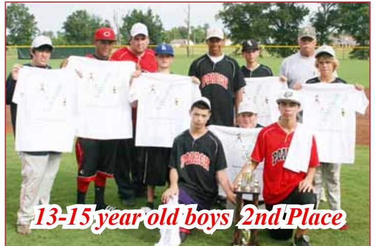
13-15 year old boys 2nd Place