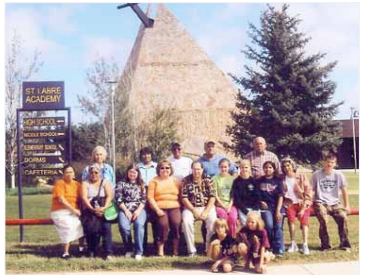
Poarch Community Church Members at St. Labre Indian School in Ashland, Montana