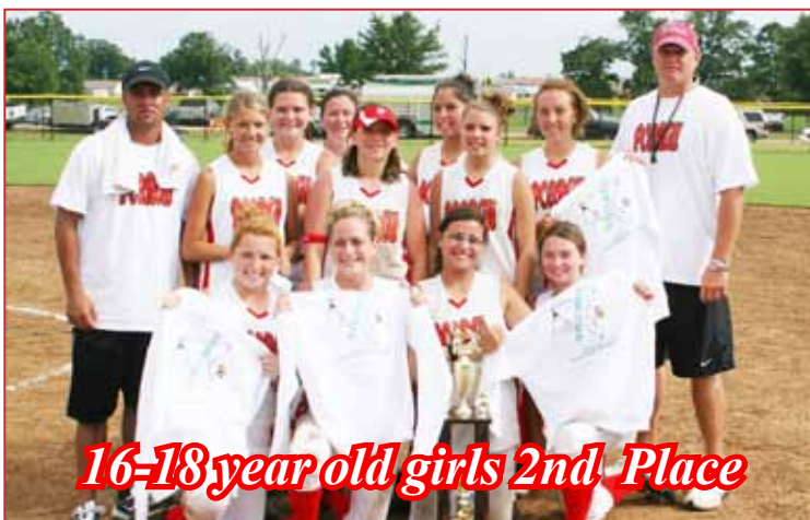
16-18 year old girls 2nd Place