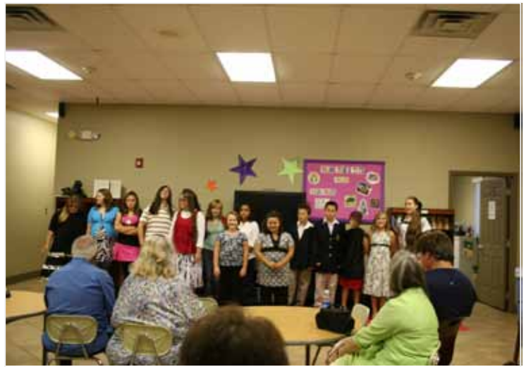
4-H participants put on fashion show for family and community members.

Spread love everywhere you go: First of all in your own house... Let no one ever come to you without leaving better and happier. Be the living expression of God's kindness; kindness in your face, kindness in your eyes, kindness in your smile, kindness. Mother Theresa