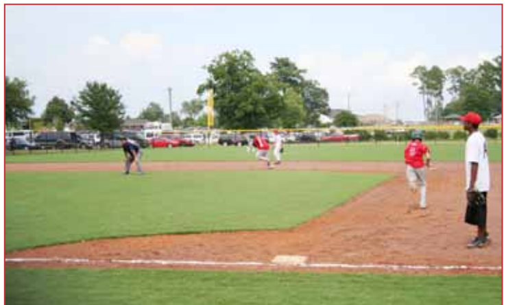
Rounding the bases!