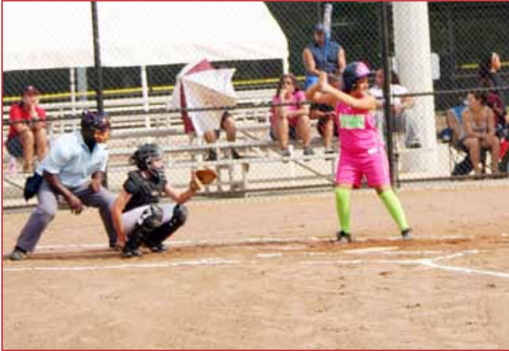
Girls 9-12 year old team the first Poarch team to take the field during tournament

The Poarch Warriors would end the tournament with that age