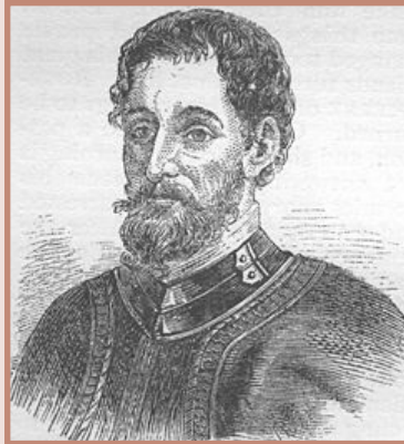
Hernando de Soto

The entrance of DeSoto into Creek country in 1540 was soon followed by that of Tristan De Luna in 1559. De Luna's forces, like those of Juan Pardo who followed him, began the Spanish practice of assisting one town or tribe within the Creek confederacy in its warfare against another. European weaponry was introduced into the Creek nation during this time, irrevocably changing Creek life. For almost an entire century, the principal European players in Creek history were the Spanish, who by 1670 had colonized much of the Atlantic