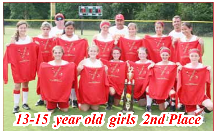
13-15 year old girls 2nd Place