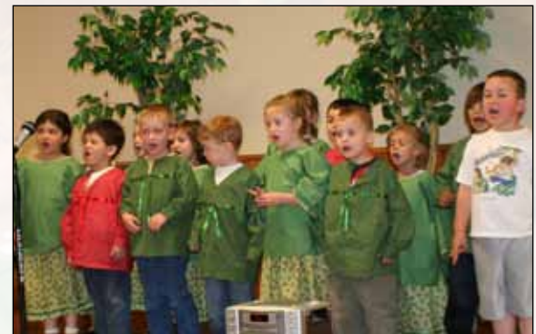
Jesus Loves Me..as beautiful in Creek as it is English.

All who attended were not surprised to learn the kids had taken first place.