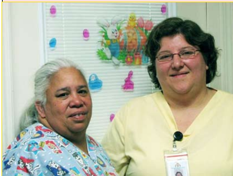
Homemaker Aide Services Page 4