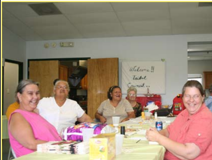
Senior Services Department Page 14