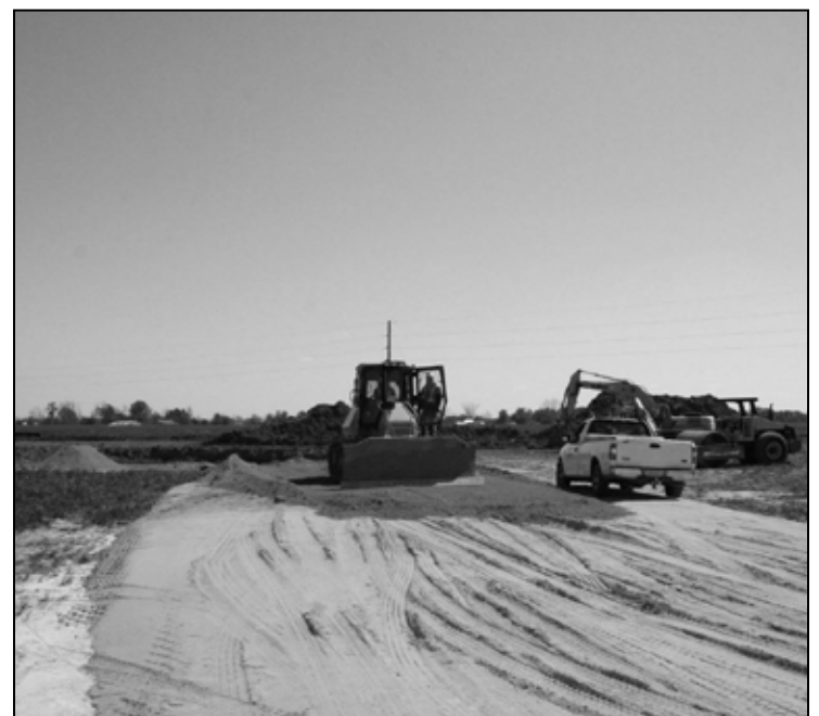
Martin Construction beings work on the new Community Cultural Education Center

The new Community Cultural Education Center will be located on the east side of Jack Springs Road. This location was chosen due to its central location in relation to other Tribal services facilities and will also serve as the centralized Welcome and Information Center of the Tribe.