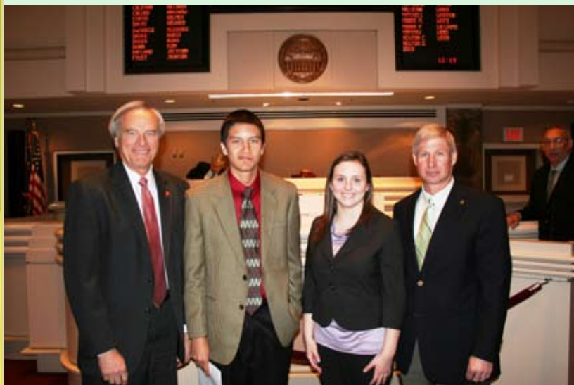
Stabler Serves as Page Page 11