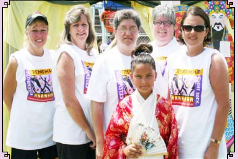
Team Photo on Saturday, April 26, 2006. Most team members were unable to attend due to scheduling conflicts.

This year's event was held on Saturday, April 26th. The Tribe's Relay team won awards for the most money raised ($12,000+), best campsite decorations (Japan), Look Good Lucy, and two of the three theme laps (Crazy Hat and Sports).